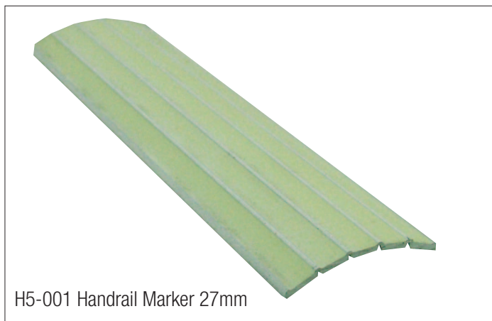
H5-001 Handrail Marker 27mm